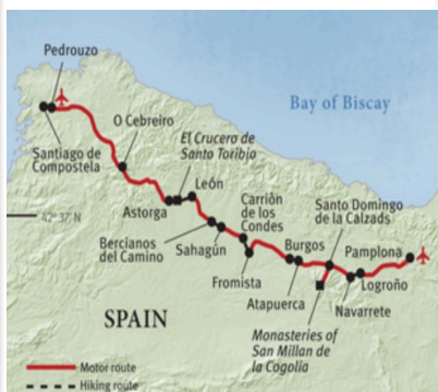
Map of el Camino